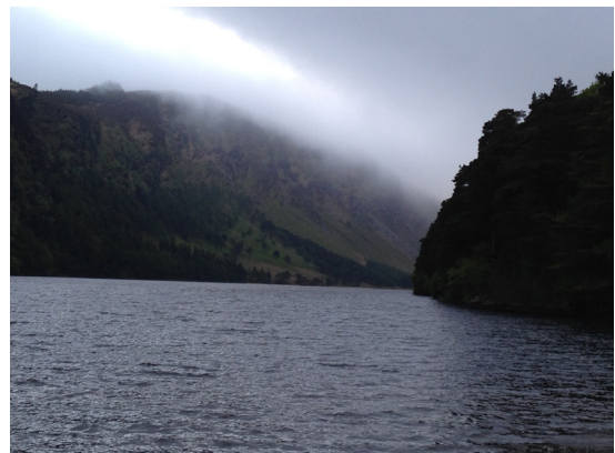
Upper Lake in Glendalough Co Wicklow